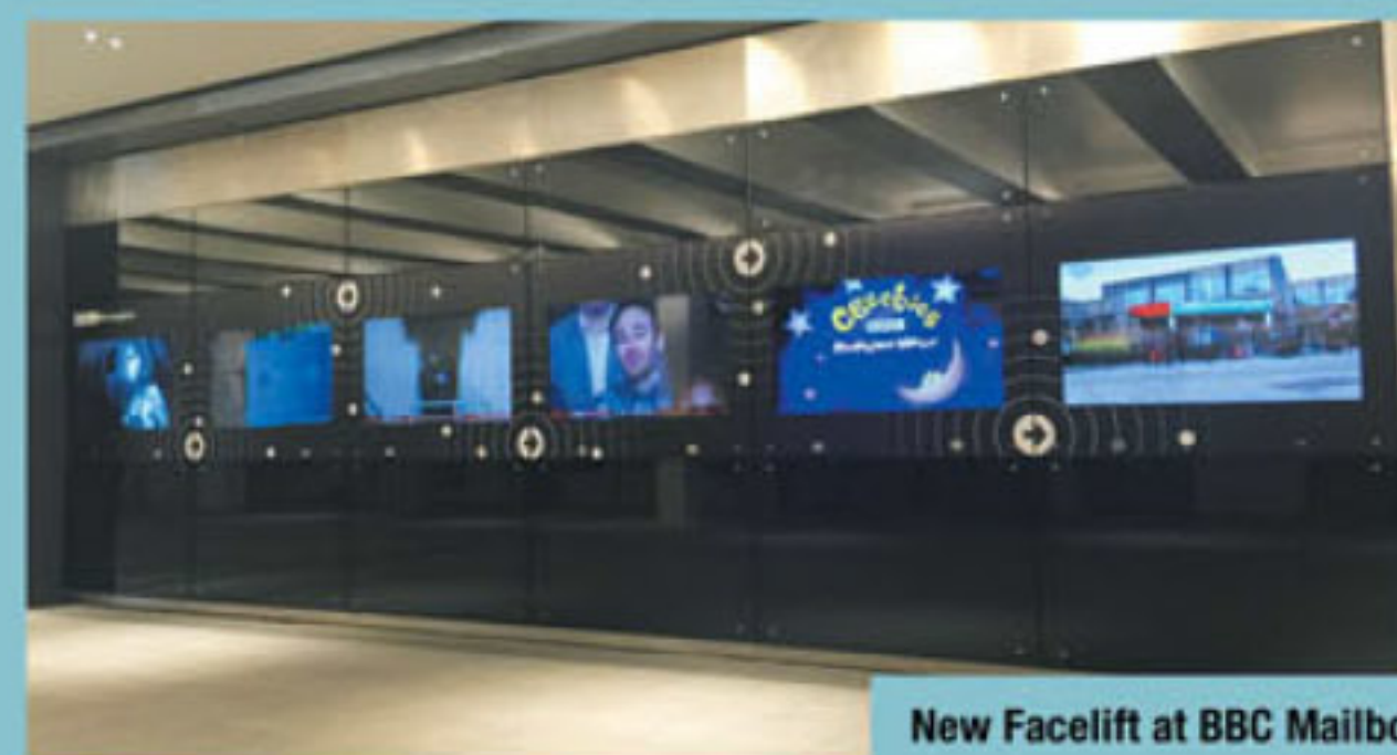
New Facelift at BBC Mailbox

With our own in-house Tempering plant our aim is to supply top quality products within the time scales required by our customers